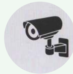
24 X 7 SECURITY