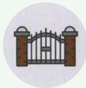
GATED AND WALLED SECURITY