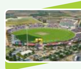
International Cricket Stadium