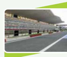
Budh International Circuit