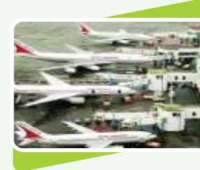
Jewar International Airport