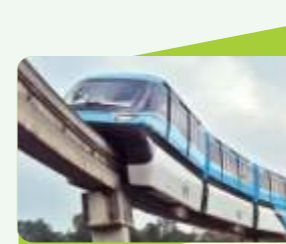
Proposed Mono Rail