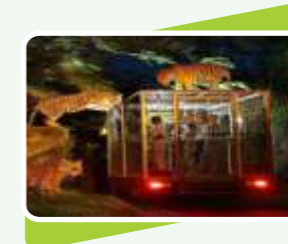
Proposed Night Safari