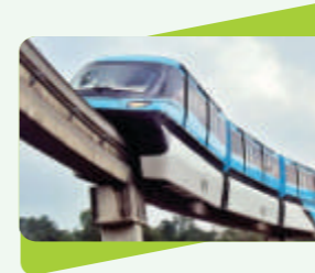
Proposed Mono Rail