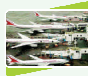
Jewar International Airport