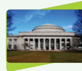
World Class Universities