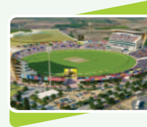
International Cricket Stadium