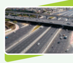
Eastern Peripheral Expressway