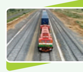
Frieght Corridor By Indian Railway