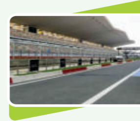
Budh International Circuit