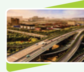
Delhi-Mumbai International Corridor