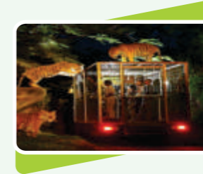
Proposed Night Safari