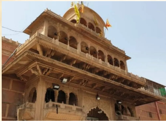
SRI BANKE BIHARI JI TEMPLE