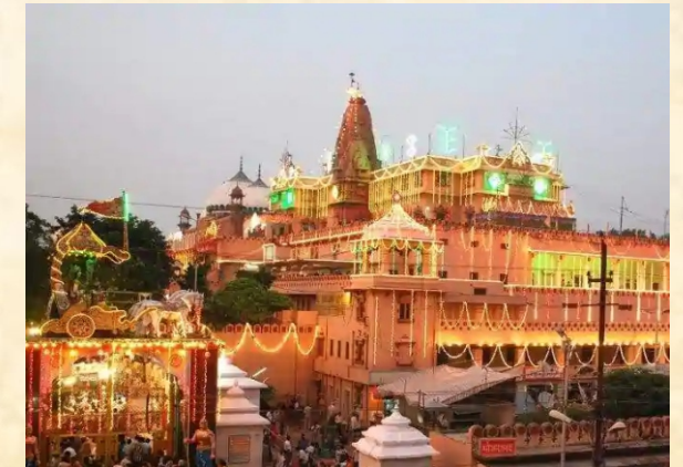
KRISHNA JANAM BHUMI